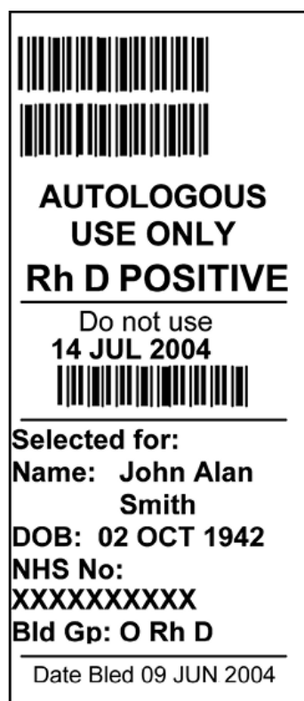
Figure 23.6 Label for unit with use limitations